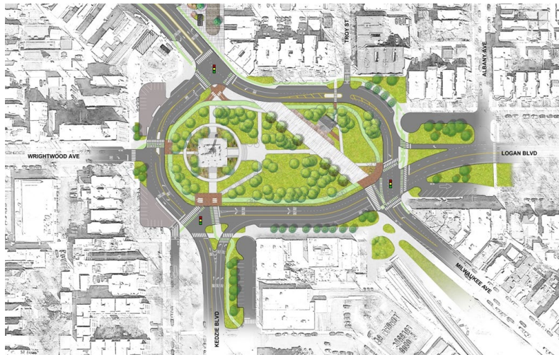
Two-Way, The Bend is the recommended design for Logan Square

Other updates to the Square include removing unhealthy and undesirable trees, improving lighting levels, and enhancing views of the Centennial Monument. The goal of the design team is to provide sufficient lighting in and around the Square by adding a mix of roadway- and pedestrian-scale lighting as well as restoring the historic globe light fixture on eight poles around the Centennial Monument. The design team launched several polls to obtain input on lighting levels, and the results showed that lighting levels are acceptable to the majority of those who participated in the poll.