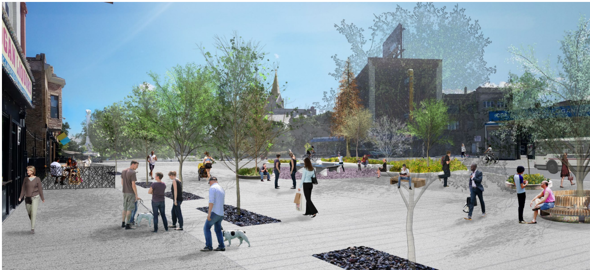
Potential Layout of Kedzie Plaza

A local partner or community group such as a Special Service Area (SSA) would be needed to maintain some of the potential design features and activate the new public spaces with programming and events.