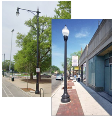
Option 1 Chicago 2000 Ornamental & Pedestrian Poles