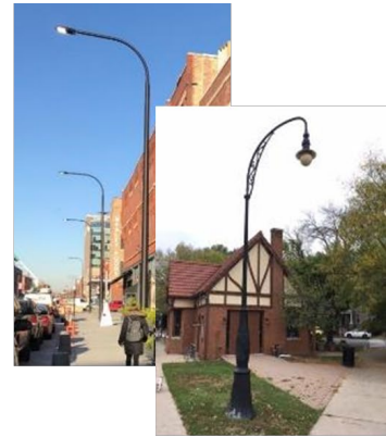
Option 3 Davit & Pedestrian Poles

For those who participated in the poll, Options 1 & 2 are most preferable.